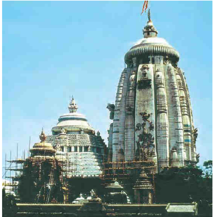
Fig. 3 Jagannatha temple, Puri.

These cultural traditions were closely linked with the ideals and aspirations of rulers. From about the eighth century, most of the present-day state of Rajasthan was ruled by various Rajput families. Prithviraj (Chapter 2) was one such ruler. These rulers cherished the ideal of the hero who fought valiantly, often choosing death on the battlefield rather than face defeat. Stories about Rajput heroes were recorded in poems and songs, which were recited by specially trained minstrels.