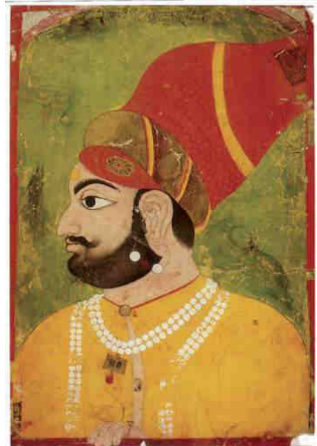
Fig. 4 Prince Raj Singh of Bikaner.