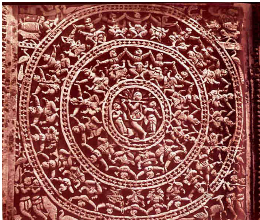
Fig. 13 Krishna with gopis, terracotta plaque from the Shyamaraya temple, Vishnupur.