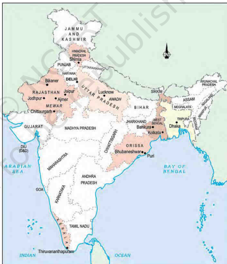
Map 1 Regions discussed in this chapter.

Did women find a place within these stories? Sometimes women are depicted as following their heroic husbands in both life and death – there are stories about the practice of sati or the immolation of widows on the funeral pyre of their husbands. So those who followed the heroic ideal often had to pay for it with their lives.