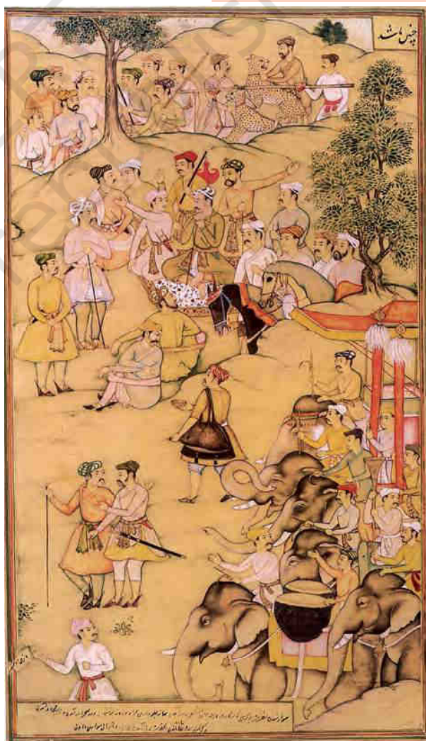
Fig. 7 Akbar resting during a hunt, Mughal miniature.

Another region that attracted miniature paintings was the Himalayan foothills around the modern-day state of Himachal Pradesh. By the late seventeenth